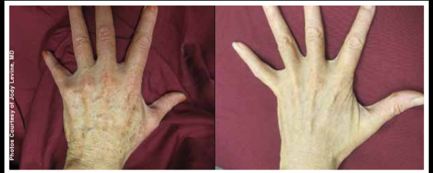
9 Months After 3 Forever Young BBL Treatments