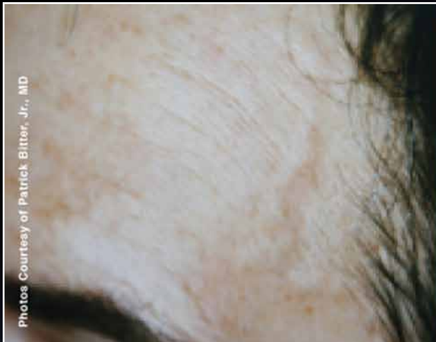
AGE 43, PRE-FOREVER YOUNG BBL