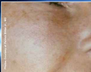
AGE 38, PRE-FOREVER YOUNG BBL