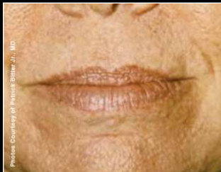
AGE 58, PRE-FOREVER YOUNG BBL