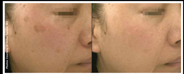
2 Weeks After 5 Forever Young BBL Treatments