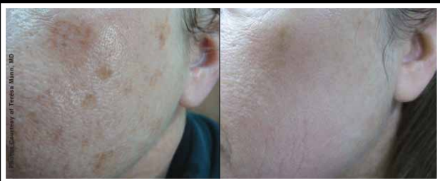
3 Weeks After 1 Forever Young BBL Treatment