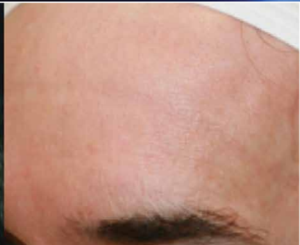
AGE 55, POST-FOREVER YOUNG BBL