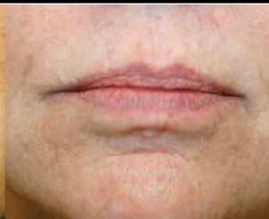
AGE 67, POST-FOREVER YOUNG BBL