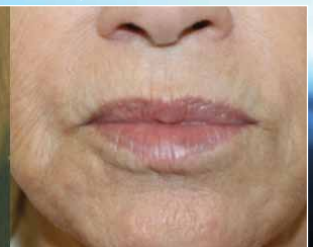
AGE 71, POST-FOREVER YOUNG BBL