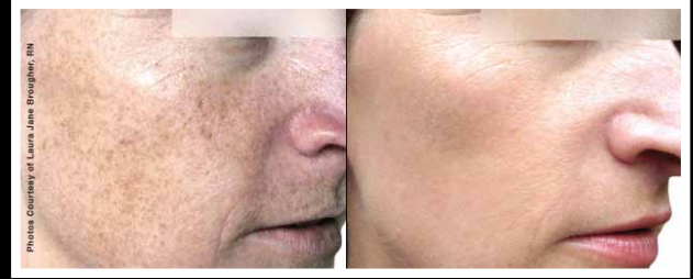
2 Weeks After 2 Forever Young BBL Treatments