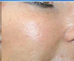
AGE 49, POST-FOREVER YOUNG BBL