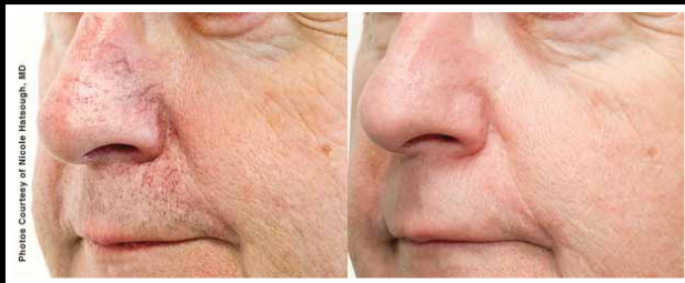
2 Months After 1 Forever Young BBL Treatment