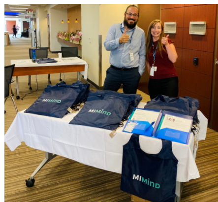
Meet members of the MI Mind team at upcoming regional and collaborative meetings.