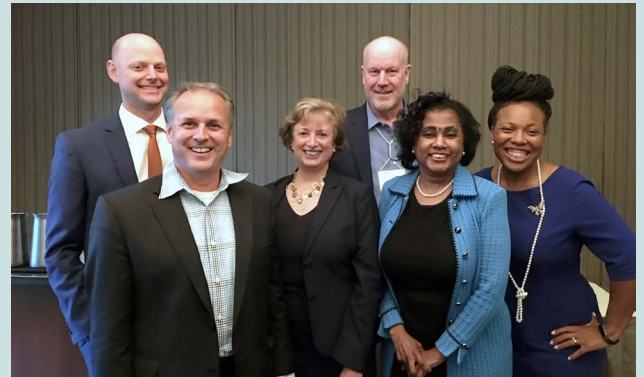
The Henry Ford Accelerating Investments in Health Communities team: